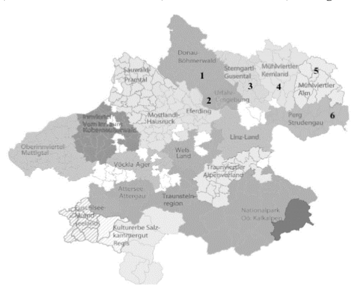
Figure 2. LEADER regions of Muehlviertel. 1- Donau-Bohmerwald, 2- Urfahr-Umgebung, 3- Sterngartl-Gusental, 4 - Muehlviertler Kernland, 5 - Muehlviertler Alm, 6- Perg Strudengau.

Source: author's own elaboration based on Regionalmanagement Upper Austria"